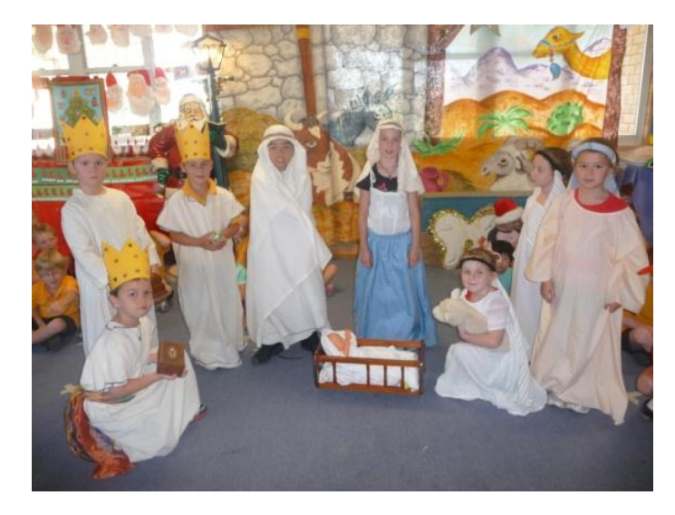
Nativity scene from today's K-1 Christmas Show