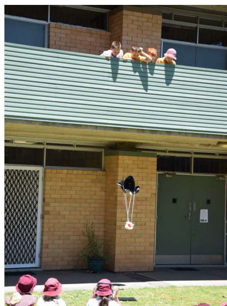
Awaiting the landing