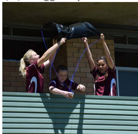
Preparing for launch