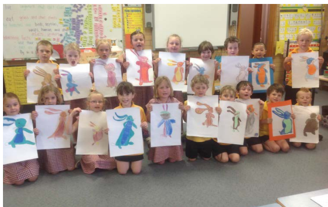
Kinders displaying their velveteen rabbits

Kindergarten read a story called "The Velveteen Rabbit". Mrs Laughie directed us to draw our own rabbits. We took our pictures to the photocopy room and made a copy of the rabbits to colour. We chose 2 Derwent Colours to colour them in.