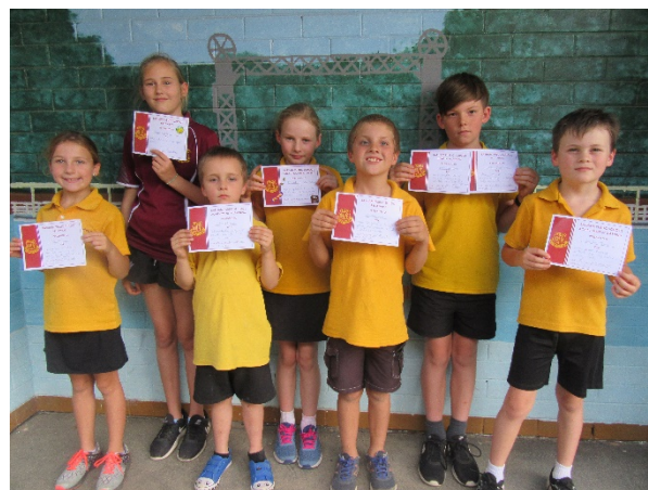
Congratulations to the recipients of the Week 3 Awards.