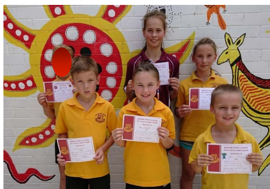
Congratulations to the recipients of the Class Awards in Week 4.

At this assembly, each class teacher presents one award – for positive behaviour and/or achievement in learning. See the flyer in this week's newsletter that explains the school's rewards system.