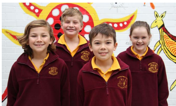
Year 2/3 Award Recipients