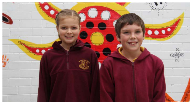
Garden and Kitchen Award Recipients