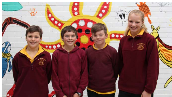
5/6B Award Recipients