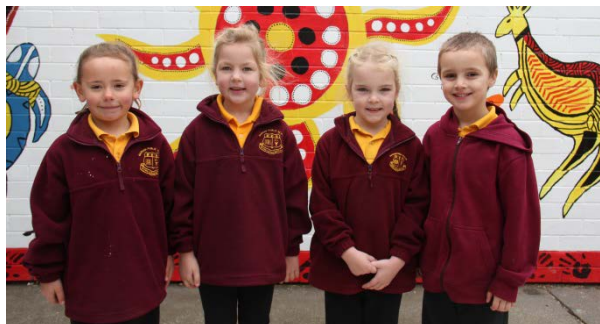
Kindergarten Award Recipients