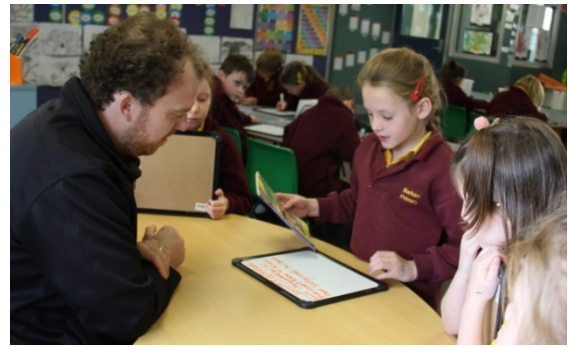
Predicting before reading