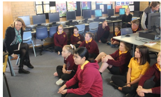
Year 5/6B gathering information about plastics and pollution – the beginning of a class investigation