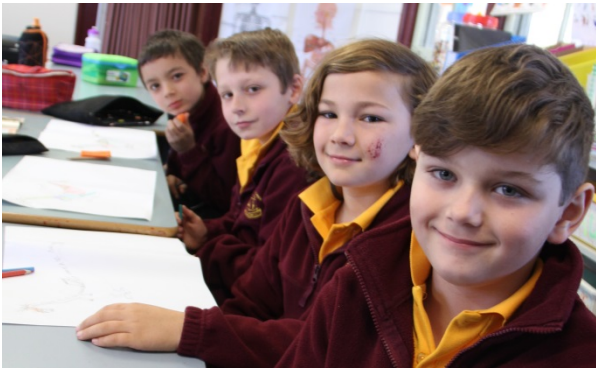
"How to Draw a Dragon" ... following directions well!