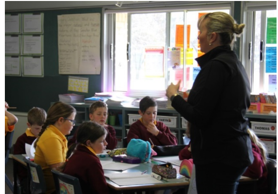
Year 4 setting up to write – looking at the success criteria.