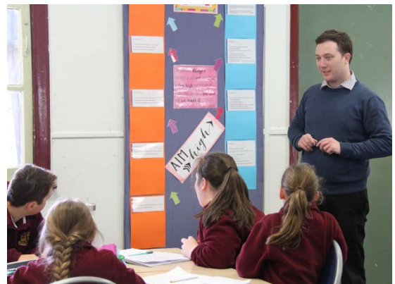
Year 5/6R learning about the 'bump it up wall', the pathway to follow to improve our writing