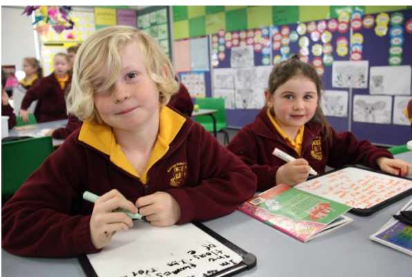
Year 1 reading and responding to what they have read