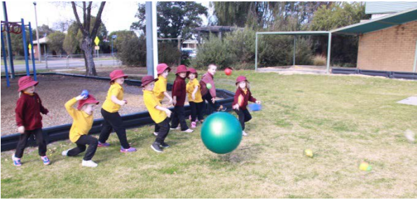
Year 1 - NAIDOC Week Activities