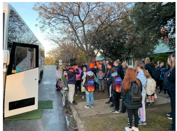
Our excited Stage 3 students departing for their Canberra excursion.

We're sure they are all having a fantastic time.