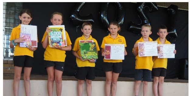
Year 2 Presentation Day award recipients