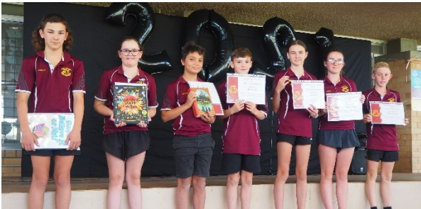
Year 6 Presentation Day award recipients