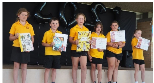
Year 3 Presentation Day award recipients