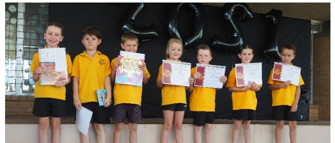
Year 1 Presentation Day award recipients