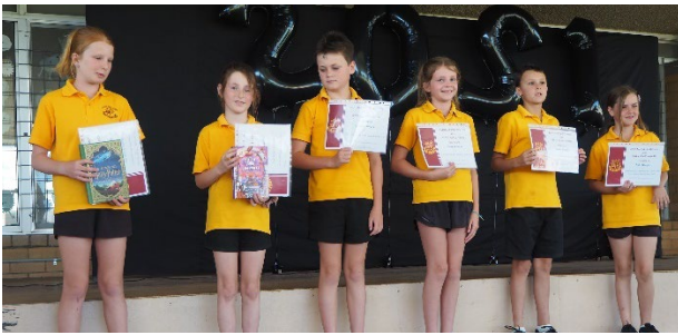
Year 4 Presentation Day award recipients