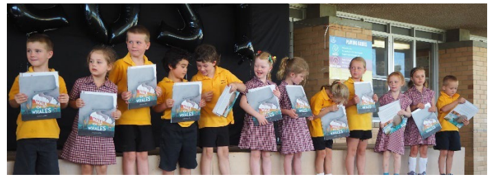
Kindergarten Presentation Day award recipients