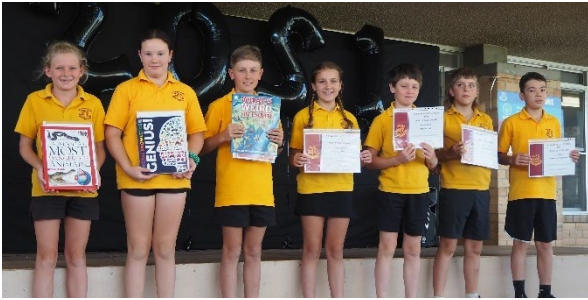
Year 5 Presentation Day award recipients